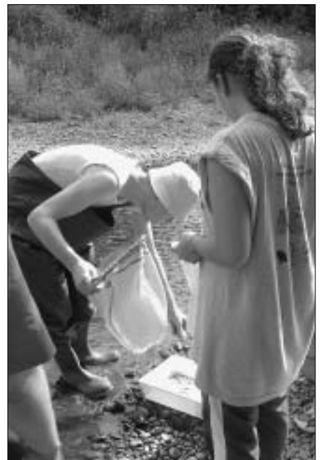
Fieldwork during the camp