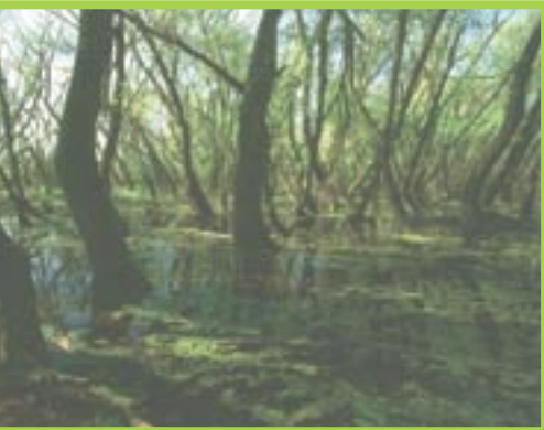
Floodplain forests along the Danube, Oder and Elbe rivers are priority habitats for Europe.

Austria. Initial estimates of the costs total 6455.5 Million USD . This is only an initial estimate of direct costs, without mitigation measures. It is more than likely that this estimate is overly optimistic and will increase in the future.