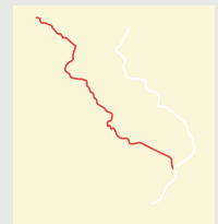
Will nature disappear due to development?

Second section: over 870 km from Pardubice to Hamburg, Germany.