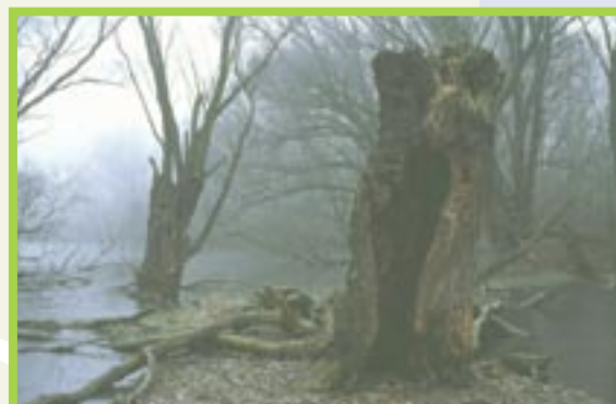
The beauty of floodplain forests.

The Danube-Oder-Elbe canal will also breach the provisions of the EU Water Framework Directive . The ambitious Water Framework Directive sets the scene for integrated and international river basin management across Europe, aiming at environmental objectives that will deliver ecological quality improvements for freshwater ecosystems across the whole continent. Construction of the canal would take an estimated 10-20 years, a period during which the EU's Water Framework Directive, will have been implemented.