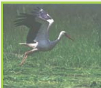
White Stork.

forests and peatlands. These and other valuable areas among the Danube, Oder and Elbe rivers will be included in the European Union's so-called Natura 2000 network of specially protected areas.