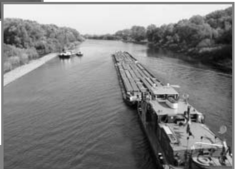
Ship on the "Hohensaaten-Friedrichsthaler Wasserstraße", a canal next to the Oder in Germany