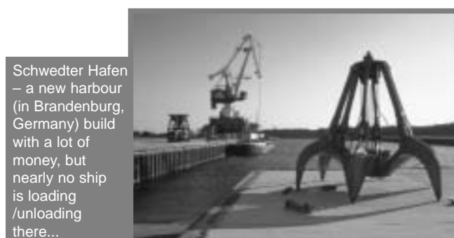
Schwedter Hafen – a new harbour (in Brandenburg, Germany) build with a lot of money, but nearly no ship is loading /unloading there...