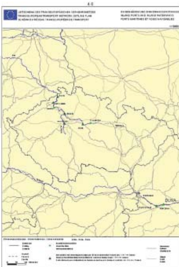
Map 2: The map 4.6 included in the Annex II of the EU Accession Treaty (AA2003/ACT/Annex II/en 1645) showing the Danube-Oder-Elbe Canal as a planned waterway in the Trans-European Transport Network Outline Plan.