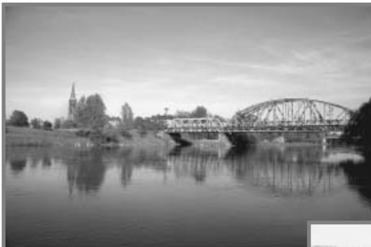
Oder River – Bridge in Glogow