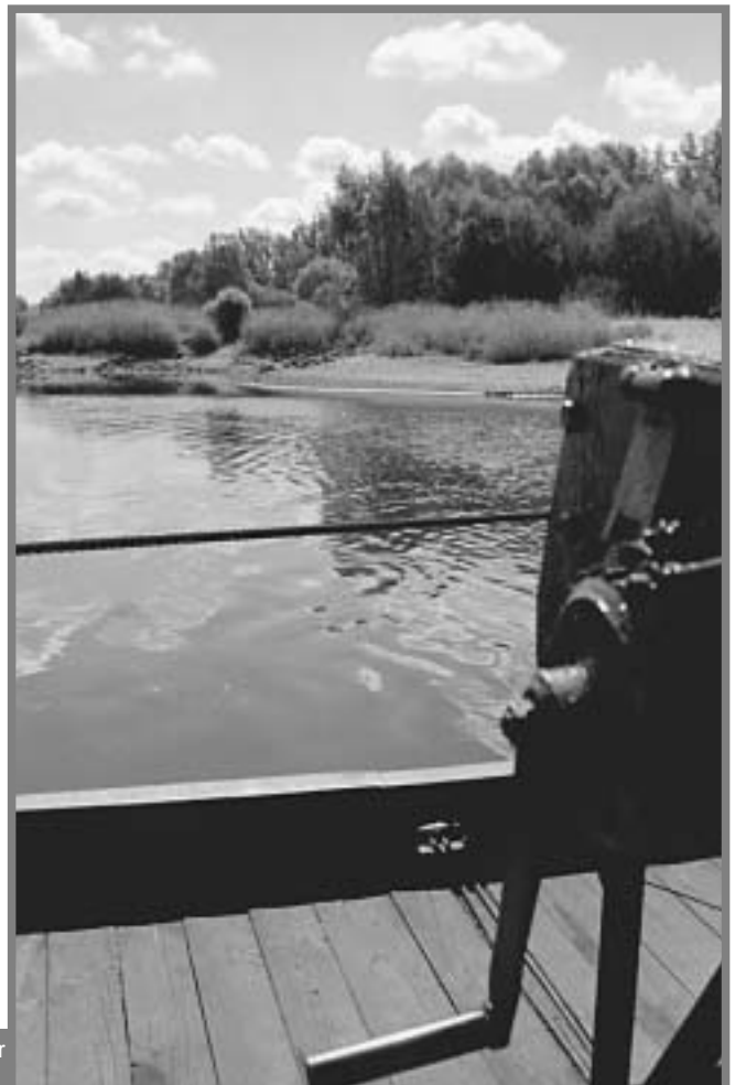
Small ferry in Poland near the German border