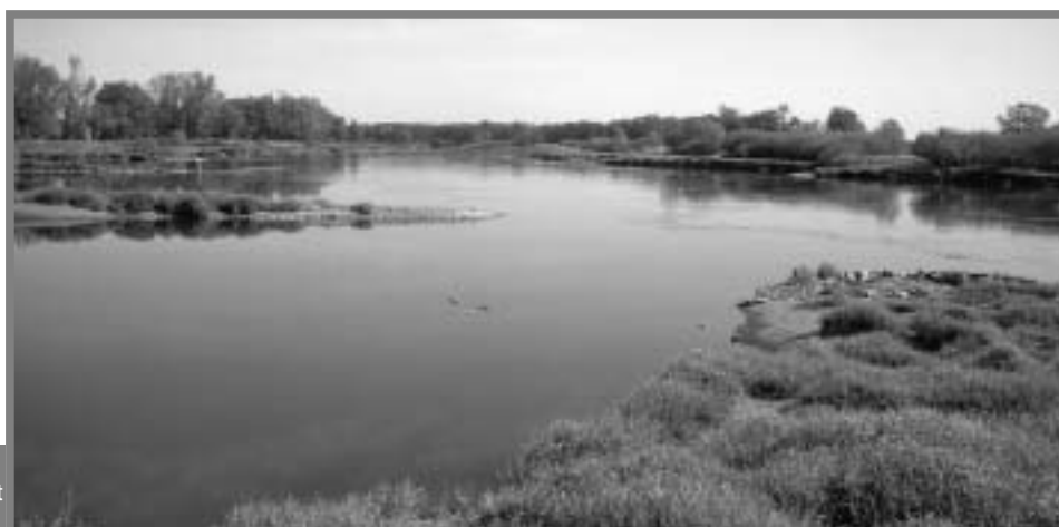
Oder near Glogow, west of Wroclaw