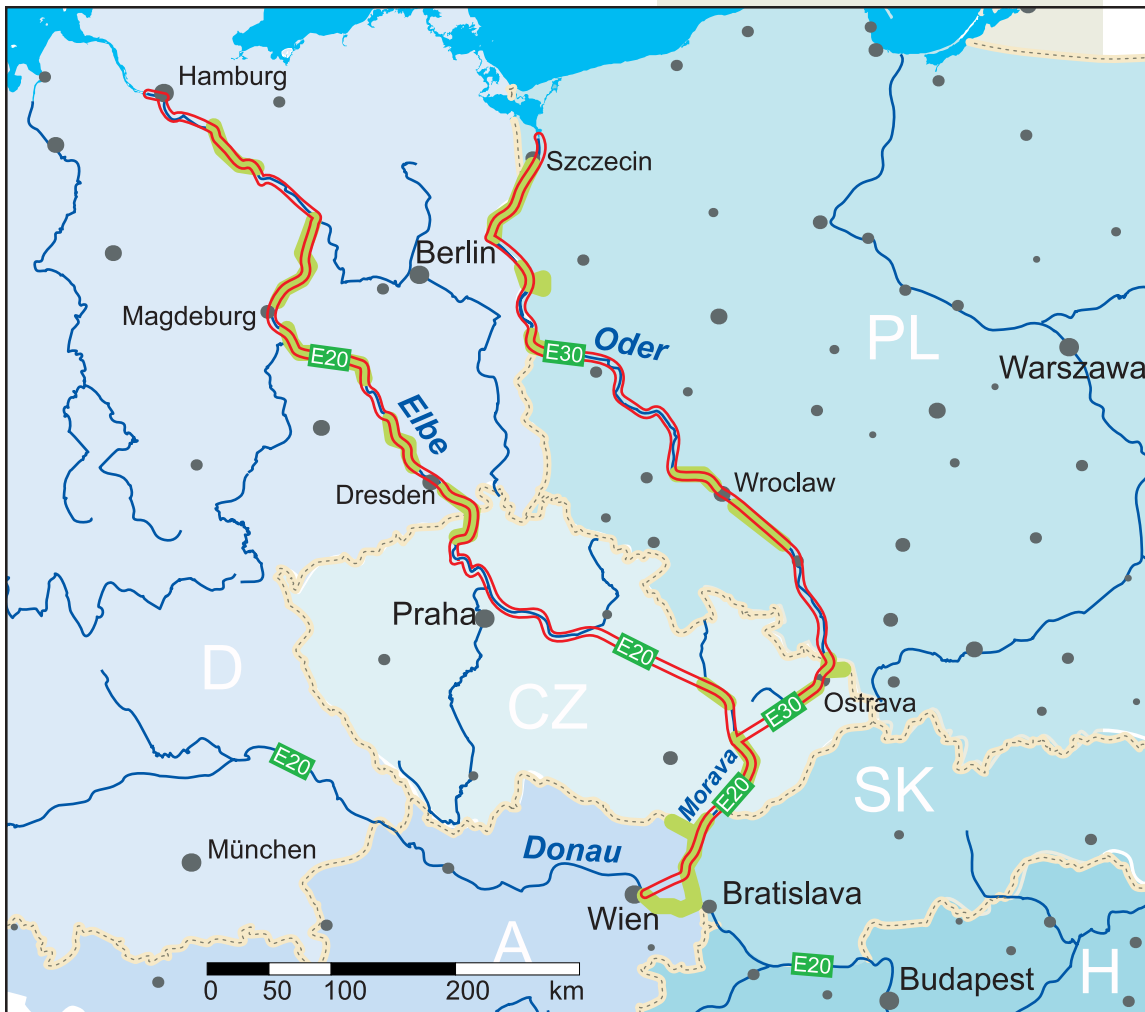
Map 1: The most probable routes of the Danube-Oder-Elbe Canal and the Oder and Elbe rivers.